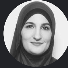
Linda Sarsour Keynote address and Q&A session. Appearing via Zoom.